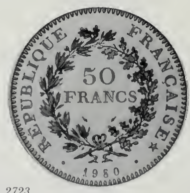
Lot No. 2723

2723 1980. 50 Francs, KM P672, mintage 500 pieces. Choice Brilliant Proof, cameo obverse, superbly reflective fields. 102 Grams.